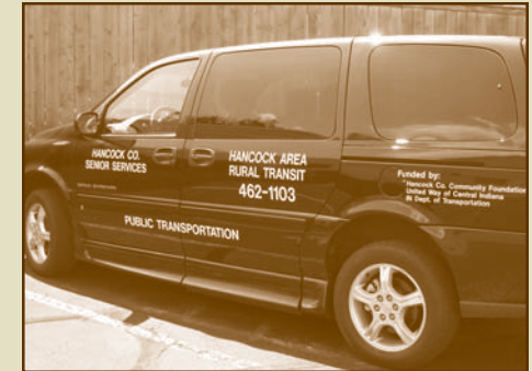
Senior Services' van, 2005 Grant Recipient