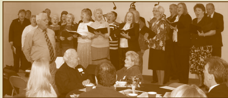
Greenfield Community Choir "Sings the Praises of a Giving Community" at HCCF Annual Luncheon.