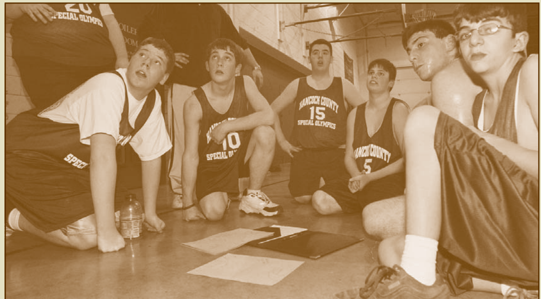
Special Olympics Basketball.