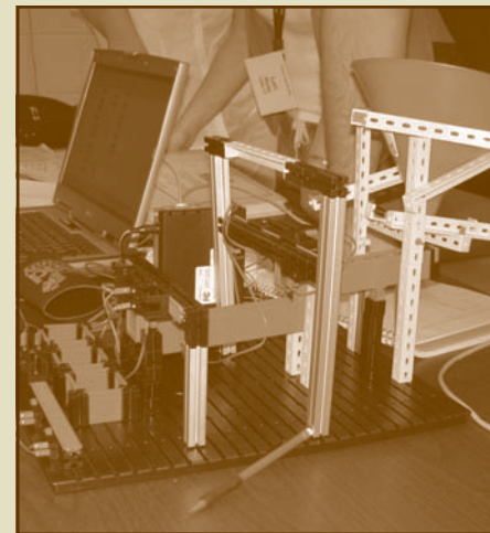
New Palestine's Project Lead the Way, 2005 Grant Recipient

HANCOCK COUNTY EXTENSION HOMEMAKERS ENDOWMENT FUND—established to provide two scholarships - one for a Hancock County resident graduating from a Hancock County high school, and the other to an adult Hancock County resident.