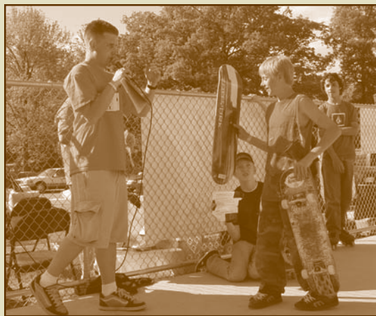
Fortville Skate Park, 2005 Grant Recipient

HCCF, together with Eli Lilly and Company, has provided the funding needed to match the 5310 capital projects transportation grant awarded to Senior Services. With these dollars, they purchased a much needed wheelchair van to further expand their transportation services to county residents.