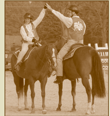
Winners of a gold medal at the Equestrian Special Olympics in September.

This grant provided funding to the Arc for its Discovery Camp, an inclusive camp which took place at Edelweiss Equine Assisted Therapy Center, for children some of whom may have developmental delays and physical disabilities. Campers of all ages and abilities did crafts, rode and groomed horses, and learned how to care for animals.