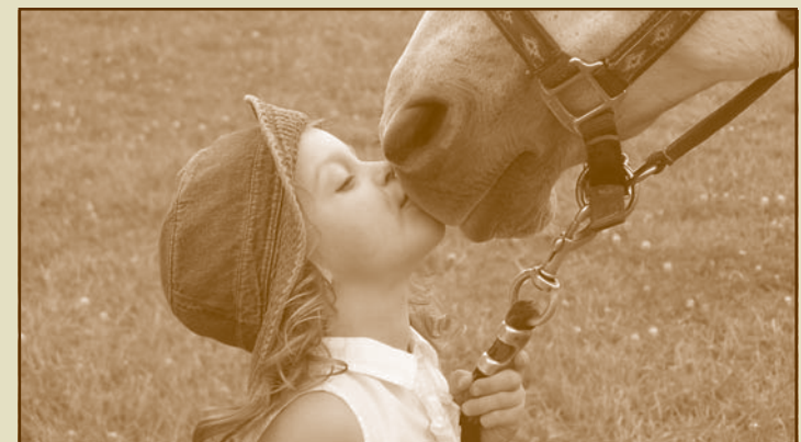
Arc Discovery Camp, 2005 Grant Recipient