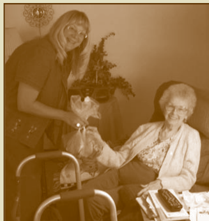
Meals on Wheels delivery, 2005 Grant Recipient

DR. AND MRS. CHARLES E. JORDAN COMMUNITY DEVELOPMENT ENDOWMENT FUND—established to benefit programs