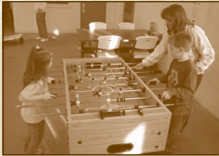
Boys & Girls Club-Shirley Outreach Program, 2005 Grant Recipient